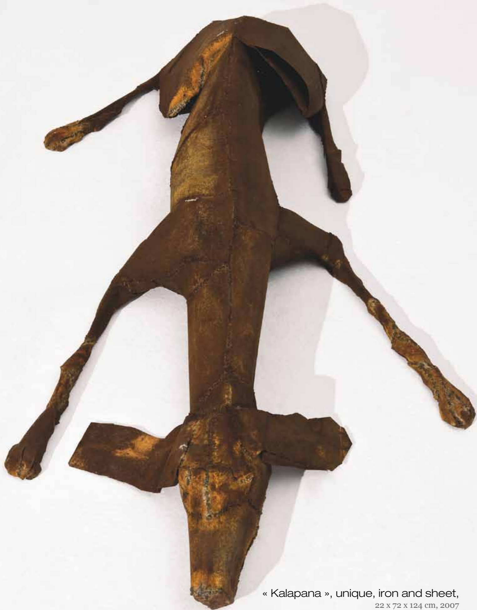
« Kalapana », unique, iron and sheet, 22 x 72 x 124 cm, 2007