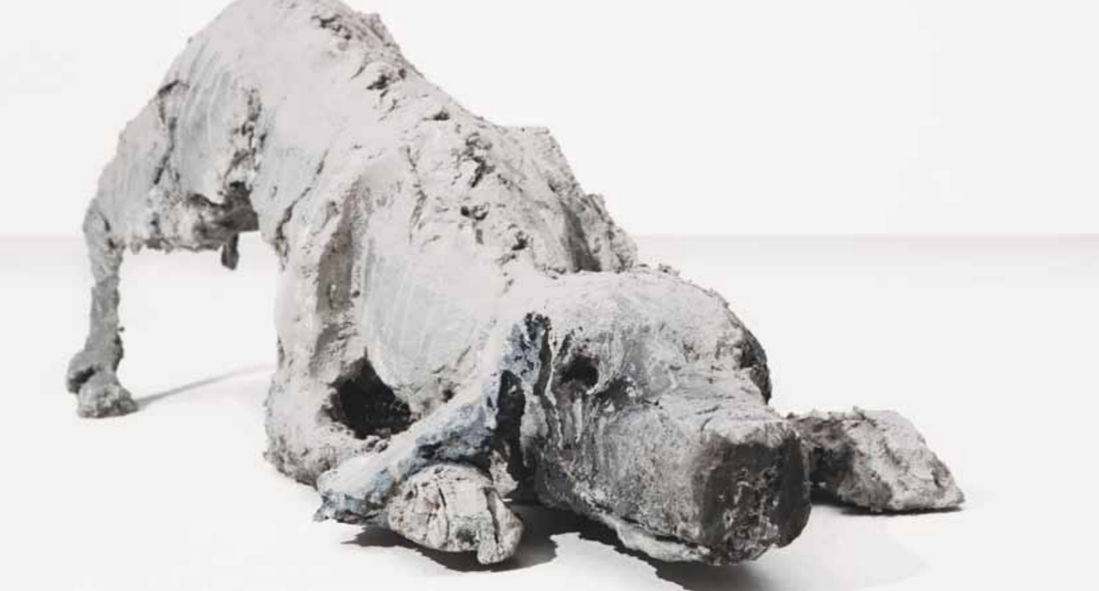
« Birao », unique, iron and cement, 45 x 49 x 153 cm, 2006.