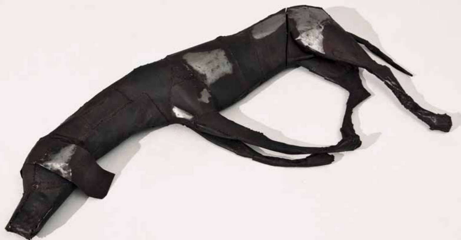
« Bannack », unique, iron and sheet, 17 x 71,5 x 138,5 cm, 2008.