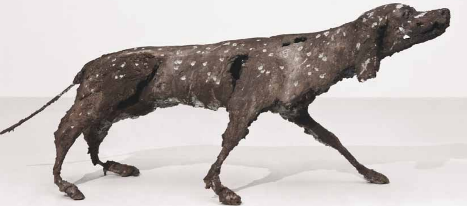
« San Zhi », unique, iron and cement, 70 x 53,5 x 171 cm, 2010.