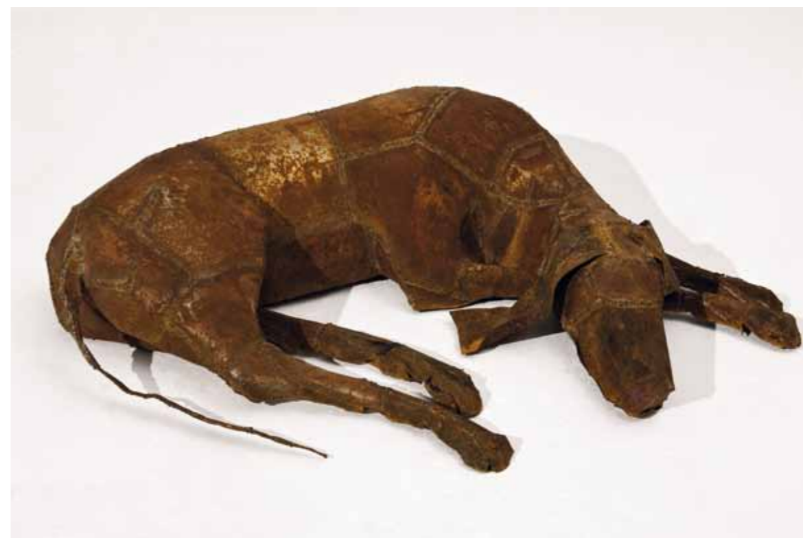
« Angkor », unique, iron and sheet, 23,5 x 91 x 70 cm, 2010.