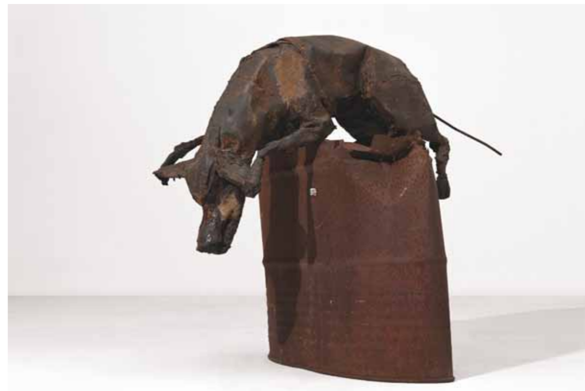
« Hashima », unique, iron and tar, 96 x 112 x 82 cm, 2006.