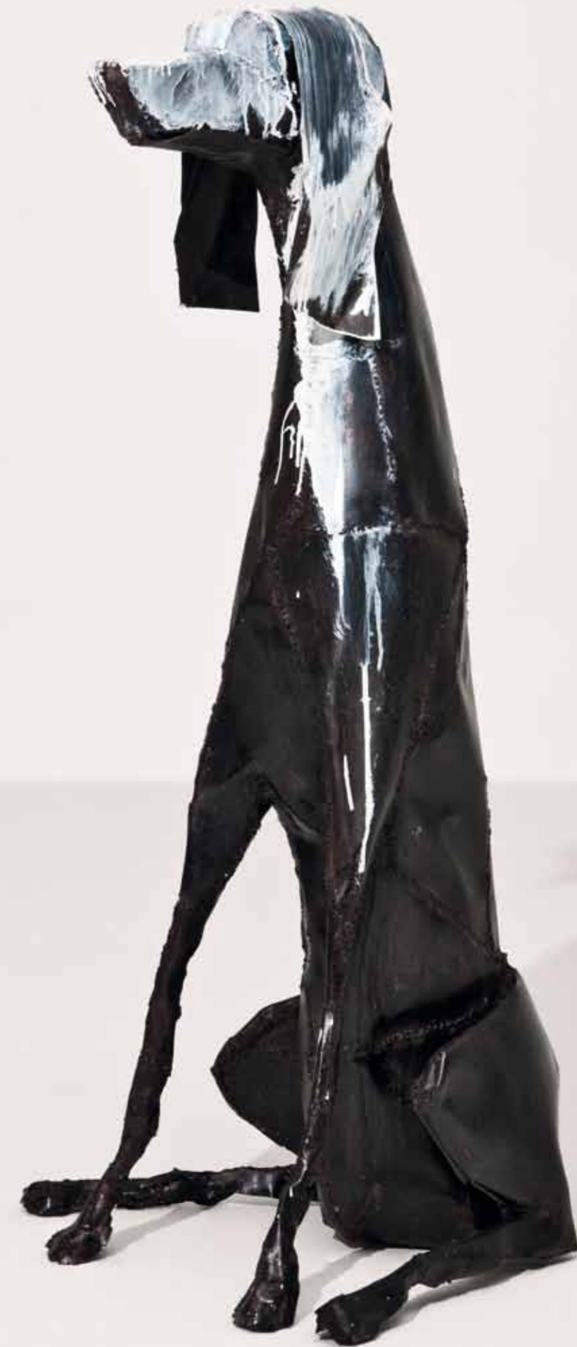
« Pripjat », unique, iron, sheet and paint, 109 x 50 x 43,5 cm, 2008.